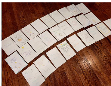
Bottom Left: Cards made by youth for KU Hospital